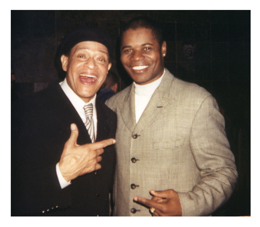
"Caesar, I love your voice" - <u>Al Jarreau</u>